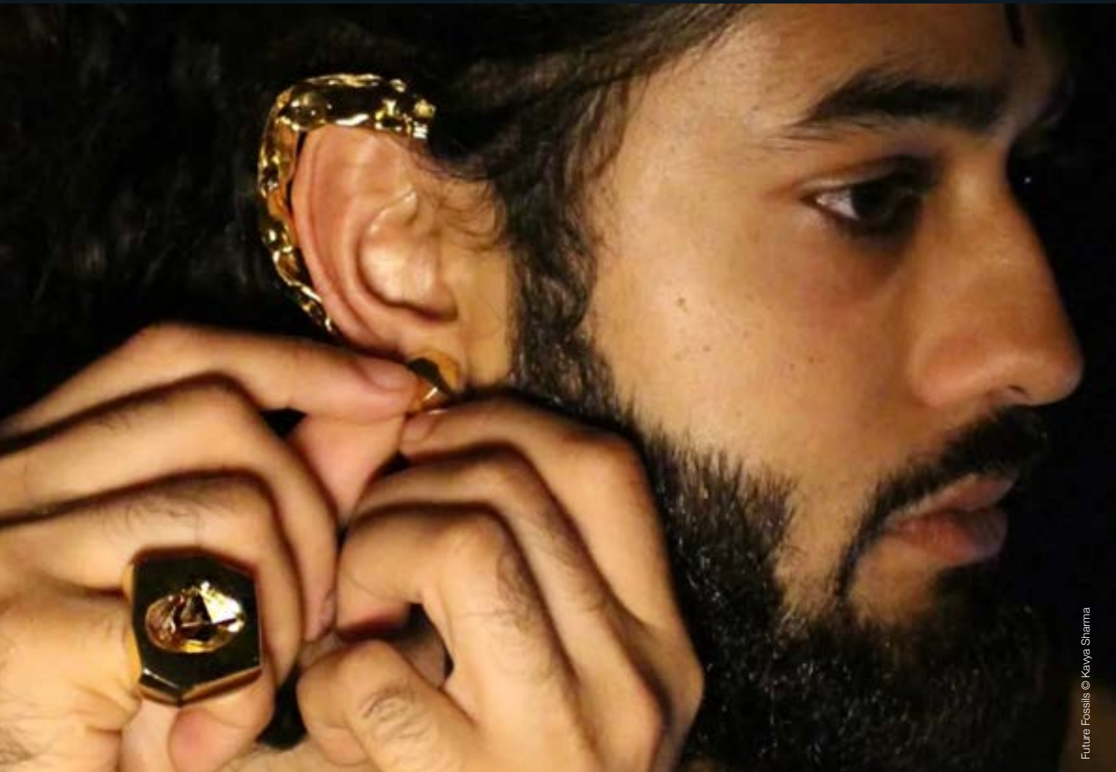
Future Fossils