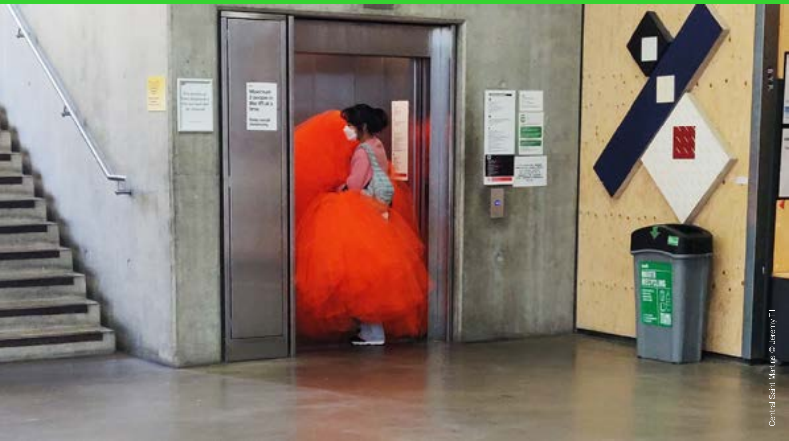
Central Saint Martins