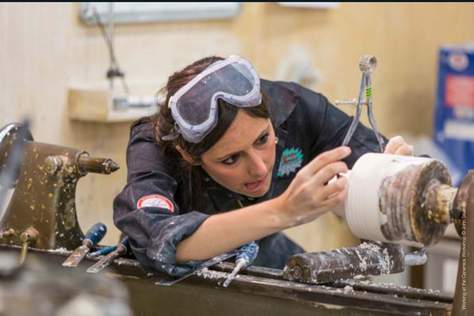
Working at the Ceramics Workshop

Thank you for your interest in the role of Dean of Academic Programmes at Central Saint Martins.