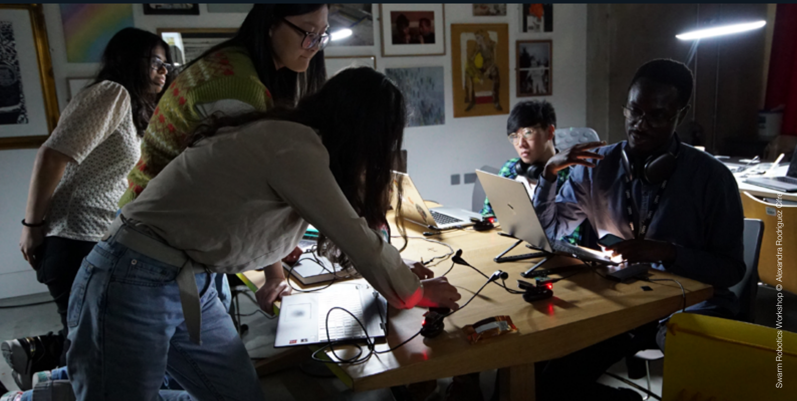
Swarm Robotics Workshop

Central Saint Martins is a pioneering leader in art and design education. With making technologies constantly evolving, we work at the cutting edge of new making and learning to prepare our students for successful careers in the creative industries of the future.