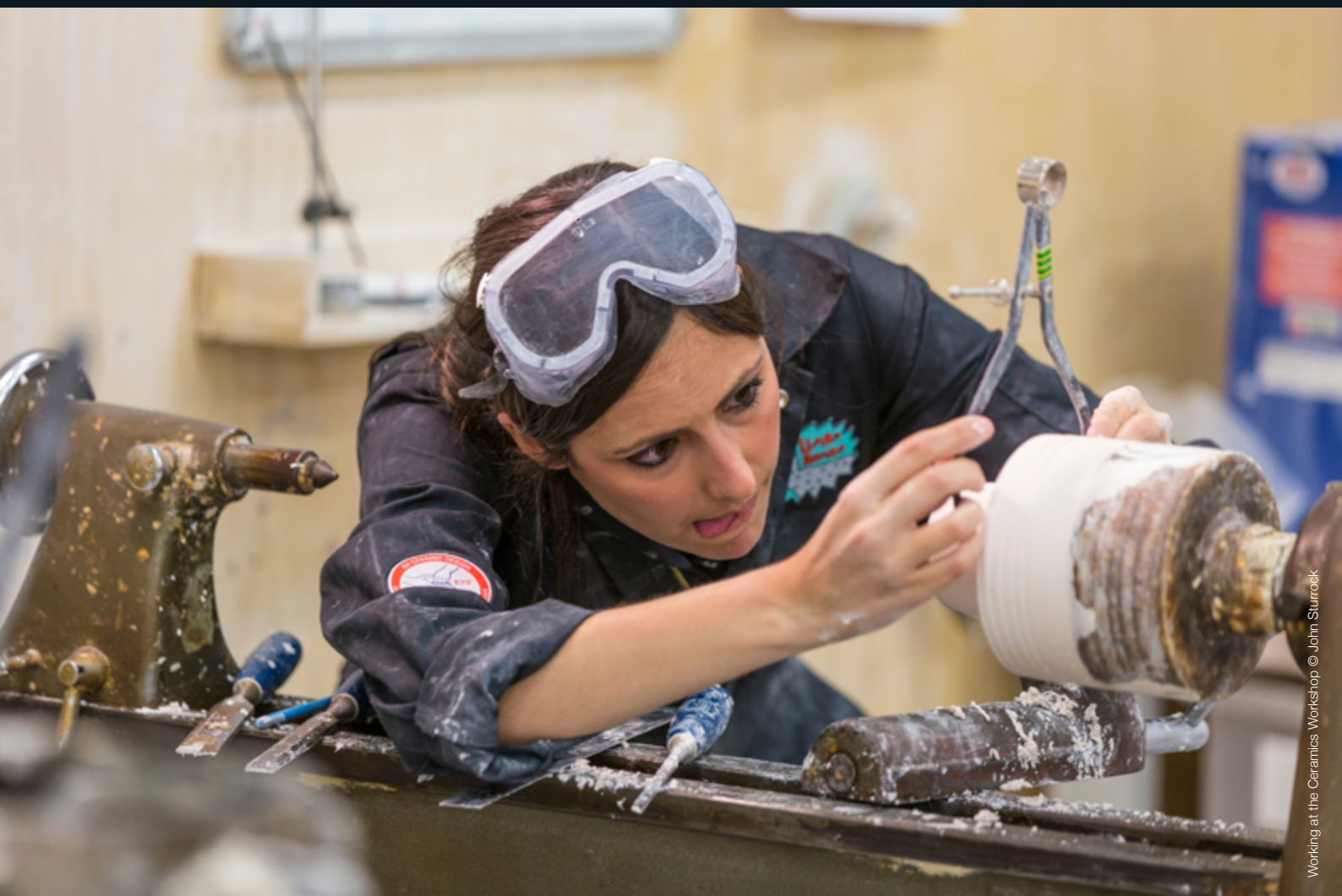
Working at the Ceramics Workshop

Thank you for your interest in a technical role at Central Saint Martins.