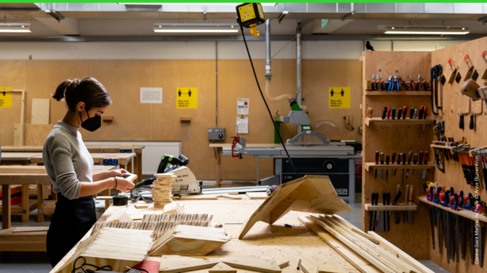
Central Saint Martins Archway © Anna Blumenkrön