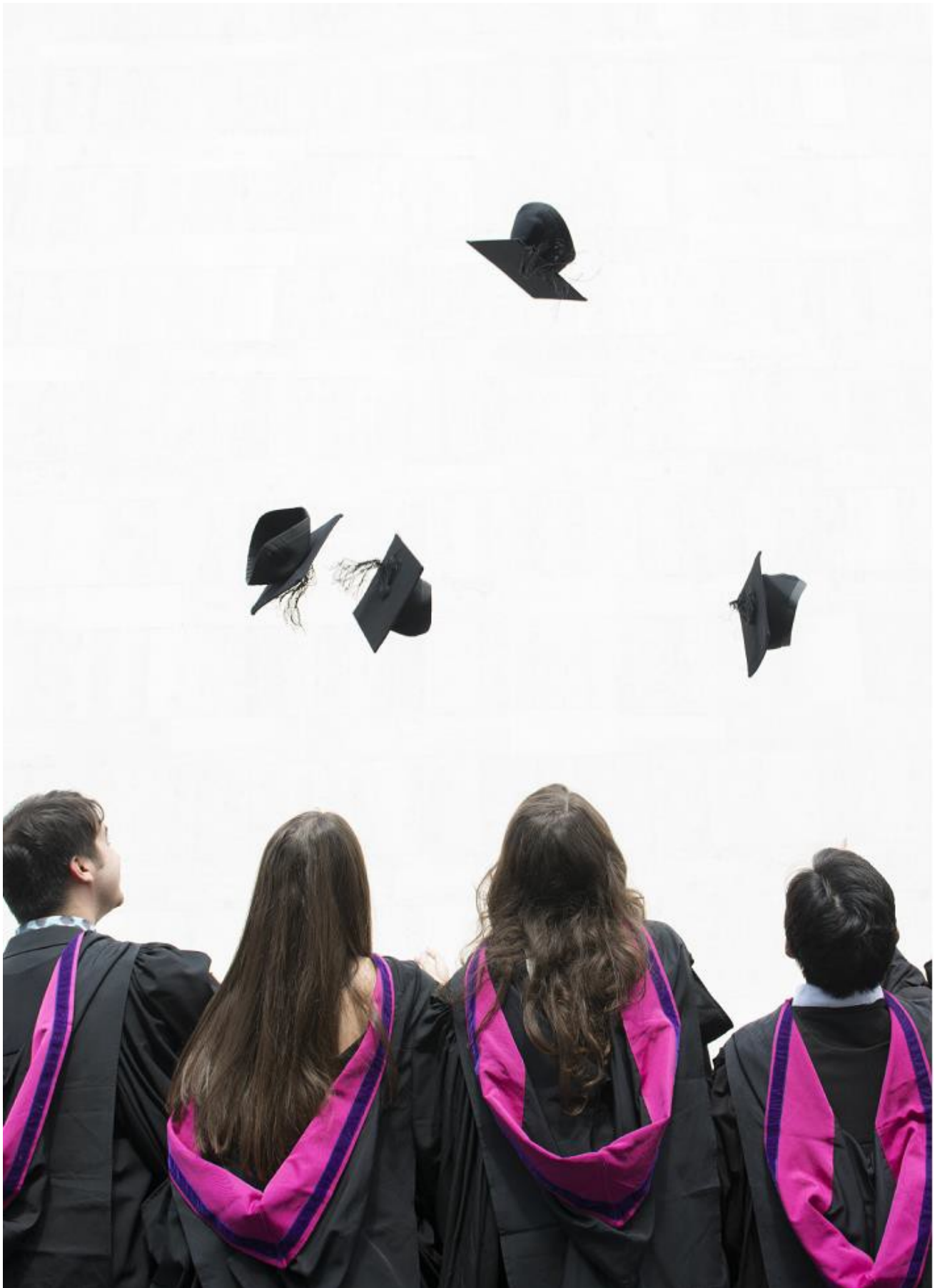
Human Resources, University of the Arts London, 272 High Holborn, London, WC1V 7EY