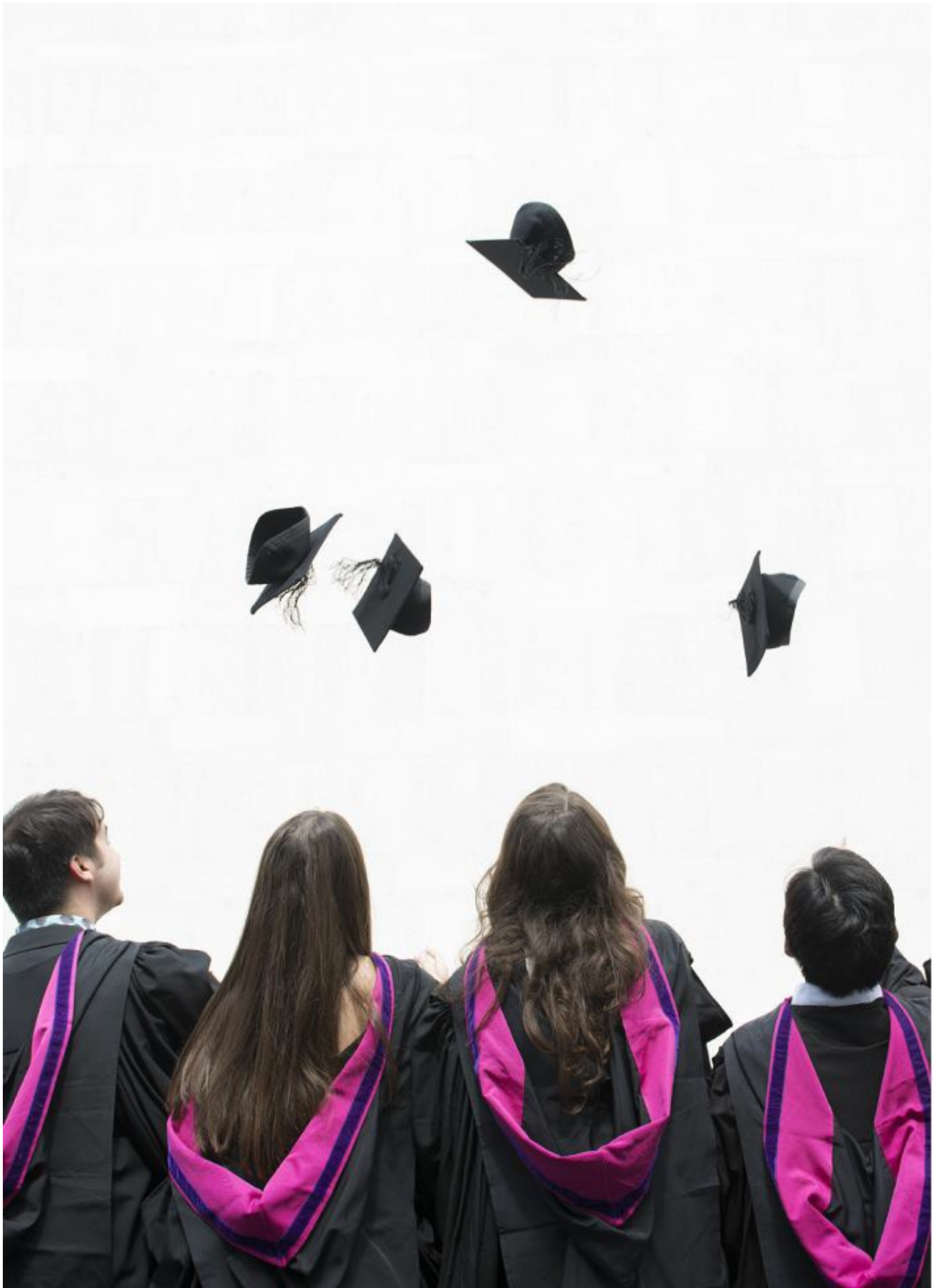
Human Resources, University of the Arts London, 272 High Holborn, London, WC1V 7EY