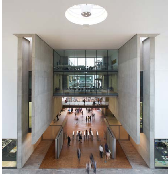
Central Saint Martins at Kings Cross

University of the Arts London is a world-leading university for teaching and research in the fields of arts, design and communication with a particular academic ethos based on its practice-led tradition. It consists of six colleges: Central Saint Martins, London College of Communication, London College of Fashion, Camberwell College of Arts, Chelsea College of Arts and Wimbledon College of Arts. The total student population is c19,000. Programmes of study are offered at FE, undergraduate and postgraduate level, plus the University has a vibrant research culture.