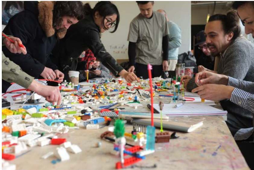
Lego Serious Play Workshop delivered by the UAL-wide Team

For the University Strategy see the UAL website: https://www.arts.ac.uk/about-ual/strategy-and-governance/strategy